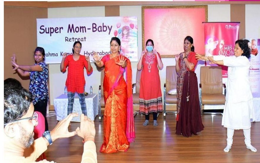
Healthy happy mother baby